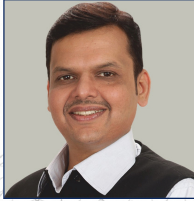
Hon. Shri. Devendra Fadnavis Chief Minister, Maharashtra State