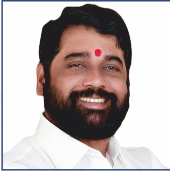
Hon. Shri. Eknath Shinde Dy. Chief Minister, Maharashtra State