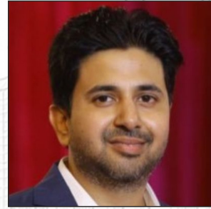
Hon. Shri. Indranil Naik Minister of State, Higher & Technical Education, Government of Maharashtra