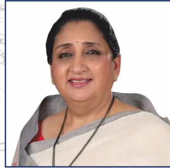
Hon. Smt. Sunetra Ajit Pawar Dy. Chief Minister, Maharashtra State