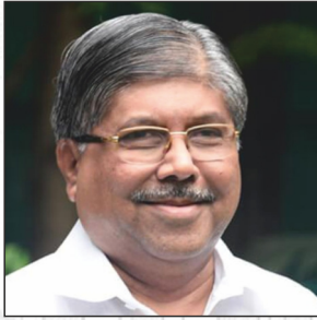
Hon. Shri. Chandrakant Patil Minister, Higher & Technical Education, Government of Maharashtra